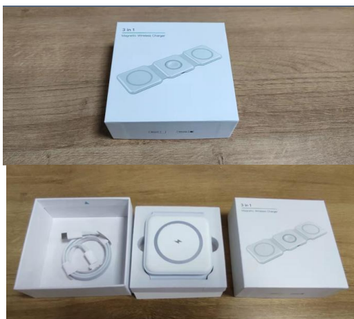
product box, 1m Type-C to Type-C cable or 1 m USB-A to Type-C cable, manual book