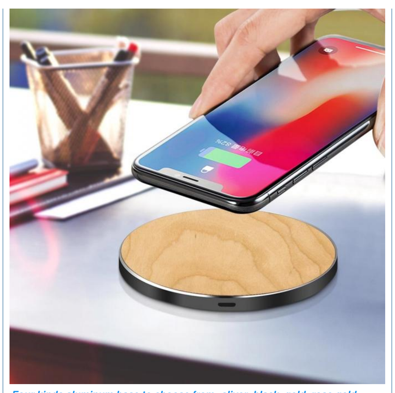
Four kinds aluminum base to choose from--sliver, black, gold, rose gold